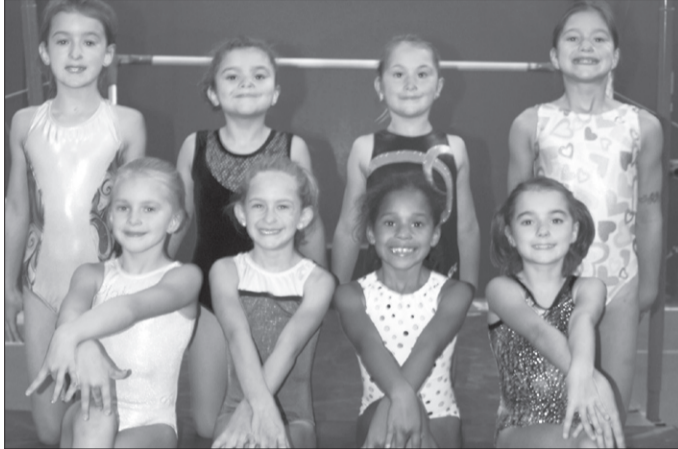
More star gymnasts from Platinum Gymnastics pose for the camera. PGA will have a meet Friday-Saturday in San Antonio Oct. 4. Call 251-2776 for more information.